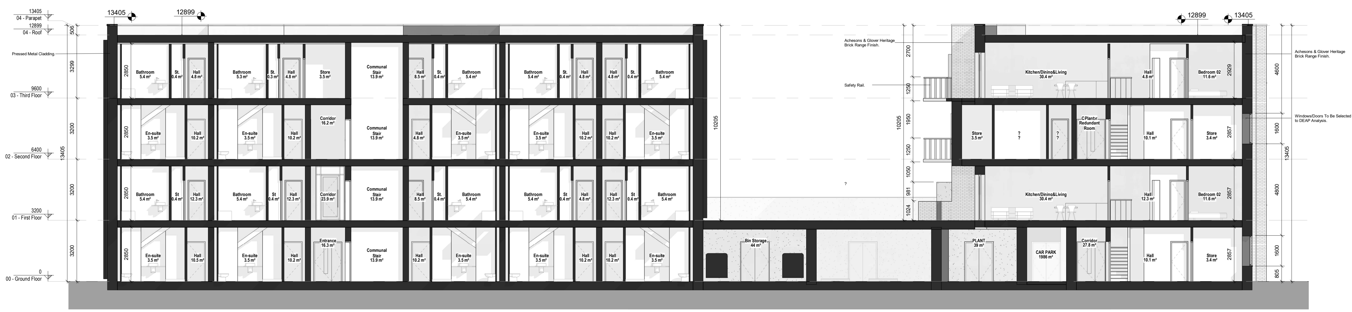
3 Section C 1:100