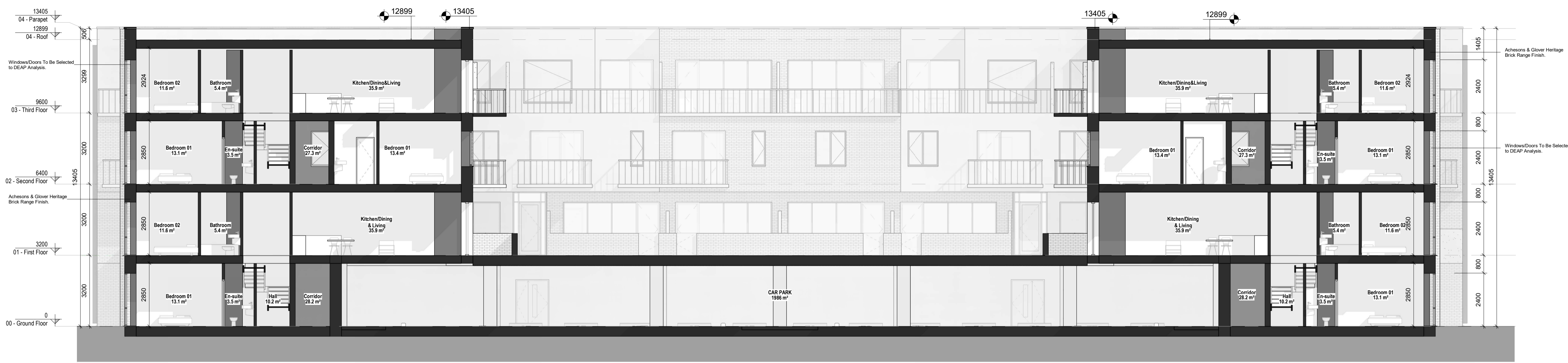
1 Section A 1:100